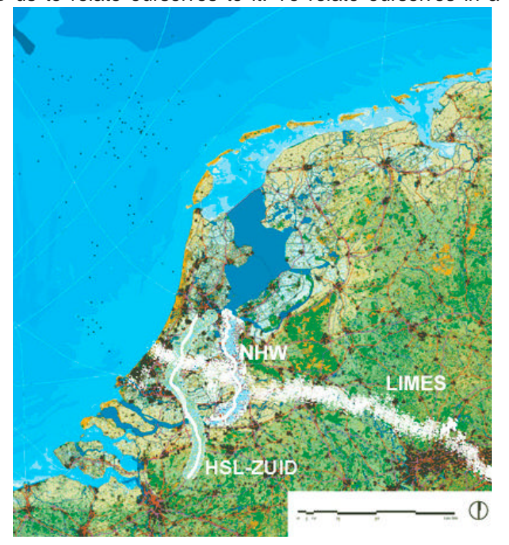
Figure 1: the location of the 3 projects.

In what follows I will analyse the way this cultural dimension is handled in three actual Dutch infrastructural projects. What relates them is their scale, the fact that their form is linear, and that they form, each in a different way and in their own period, the actual spatial reflection of a global system.