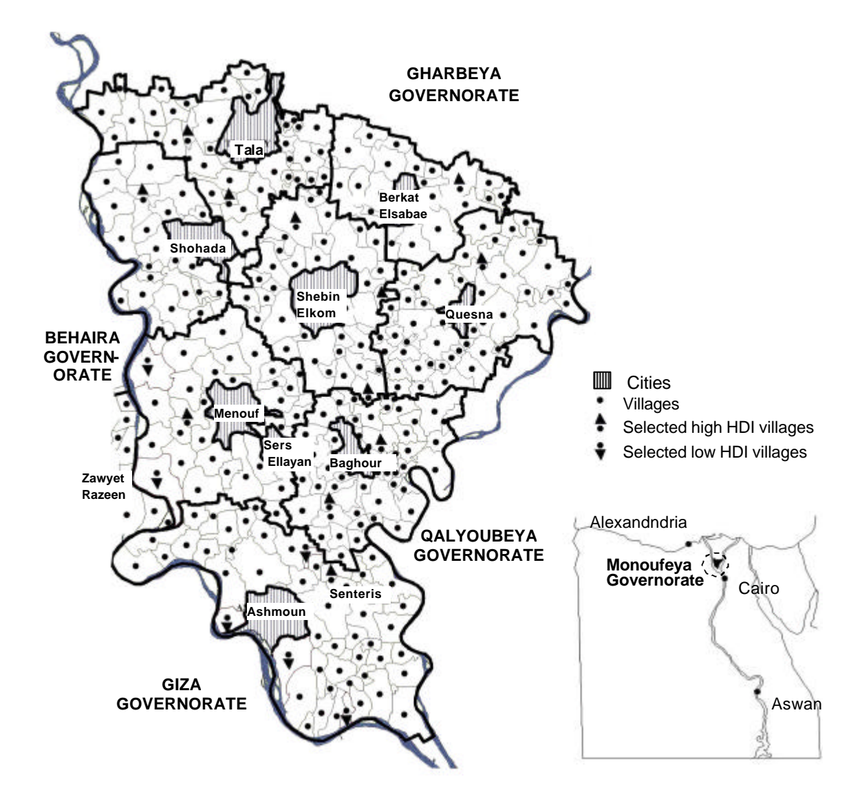
Figure (2) Selected villages for the case study

Selected villages for this paper's case study belonged to the two contrasting categories of villages with high and low levels of HDI in the Monoufeya governorate (located north of Giza governorate).<sup>18</sup> The study of these villages adopted a two-fold course of action that depended on extensive interviews with local authorities and community residents alike. First, problems and needs of the community were identified. Second, different programs and projects implemented in the villages were assessed, exploring and evaluating their effectiveness in improving living conditions.