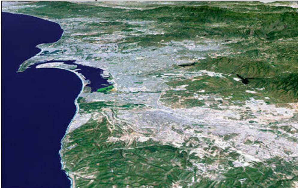
Figure 1 Satellite View of San Diego