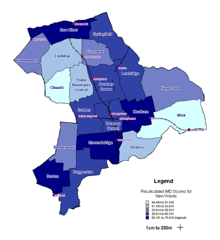
Hackney 00 0 Cover Copyright.

Hackney has been on the forefront of news and lifestyle magazines for more than ten years now, adopting both a glorifying and a condemning identity. Hackney is one of the most deprived London boroughs ranking very high on the National Index of Multiple Deprivation. Not only as a general picture, but even on a ward level, all of Hackney wards are among the 10% most deprived wards in England and 7 among the worst 3% (index of Multiple Deprivation 2000).