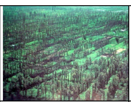
Gridlike configuration of Chinampas

At present the urban area of Xochimilco includes urban settlements established in the area of environmental protection. What were once croplands are now the site of more than 350 illegal settlements. sixtv