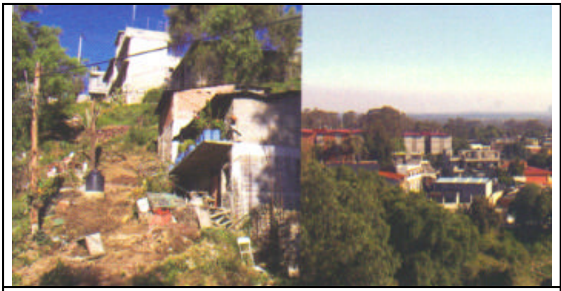
Invaded through the illegal sale of land

The area has also been threatened by real-estate developers intending to privatize and develop a considerable extension of communal lands and turn them into residential areas, a golf club, and a hotel and recreational area, on the pretext that they intended to prevent illegal settlements. These were not allowed because illegal settlements would have sprouted anyhow around the development itself due to the demand for labor, because they would modify the socioeconomic structure of Xochimilco by widening the gap between the rich and the poor and entail other negative environmental impacts such as: a greater demand for drinking water, soil pollution by the chemicals used on the golf course, and the increase in the traffic carried by the already saturated traffic lanes serving and connecting the area with the northern part of the Federal District.