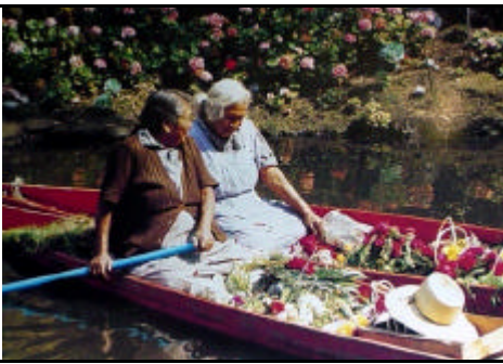
Flowers and vegetables suppliers

new neighborhoods and twelve housing complexes. Most of these human settlements are not more than 35 years old. Most of the native residents of Xochimilco consider this as an aggression. Forty percent of new residents live in irregular settlements and therefore are not legally entitled to have complete urban services, and the natives feel they are being invaded through the illegal sale of land, which encroaches on the hills, aquifer replenishment area, the chinampas and other croplands.