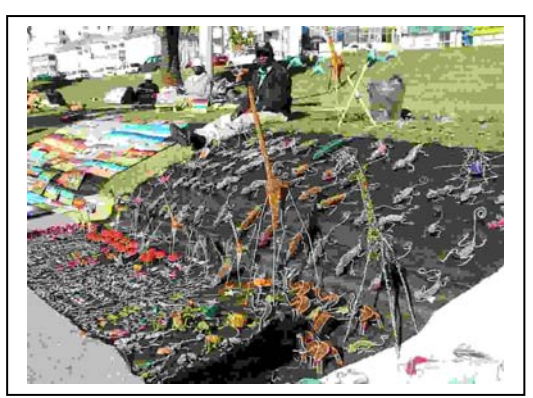
Figure 8: Beachfront Wire Art Trader

In addition to these informal markets, there are a number of commercial curio shops and art galleries that service the tourist market and that stock and sell wire art. In the Eastern Cape there are a number of these galleries and curio shops, they include amongst others the Wezandla Gallery, Afro Dizzy Curios, Matopi Products and the Bushpig and Wildlife Gallery all in Port Elizabeth, Creative Touch in Port Alfred, African Adventures and Pula Pula in Graff-Reinet, and the Dolphin Beach Indoor Flea Market in Jeffreys Bay. These are all privately owned commercial businesses that either enter into supply contracts with wire art craftspeople or who buy wire art on an ad-hoc basis. These formal businesses are all housed in commercial buildings located in busy and accessible parts of their respective towns or cities.