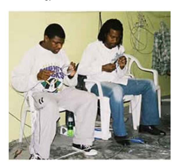
Figure 2: Wire Art Craftsmen

The manufacturing of wire art objects takes place in townships and in the rural areas in informal cottage industries (2). Many small businesses are based on this and both manufacture and sell from the same premise. A room in a township house, a garage or a rural hut will all suffice. A simple workbench and basic tools including pliers, a hammer and a carpenter's vice are all that are needed. The basic raw materials include galvanised mild steel wire of various gauges, but generally around 1,5mm diameter, and a variety of coloured beads. This is hand-craft production based on skill and enterprise and demanding little capital outlay and low technology.