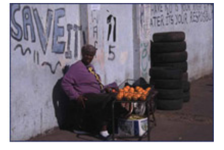
Figure 1: Street Hawker in Umtata, South Africa

Thirdly, with the rapid increase in unemployment in South Africa (now estimated to be around 40% of the workforce), informal sector work is increasing as individuals and families struggle to survive.