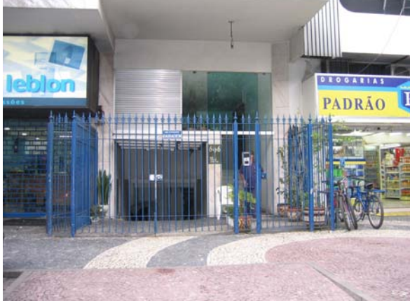
Fig. 1 & 2: Controlled environments in typical residential and mixed-use streets are strong elements of the new the Brazilian cityscape.

This phenomenon is particularly strong in areas generated by modernist spatial morphologies which proved to be more easily appropriated by the private sector in segregating social realms (del Rio & Santos 1998). The corbusian model of "towers in the green", single-use zoning, and vehicle circulation generated disjointed districts of large distances between buildings, a landscape of highways, and public areas that are no-man's land. Today, the vast majority of successful residential developments are gated, which generally follow architectural styles inspired in Miami- ish imageries so dear to the middle-class. New post-modern social and cultural metaphors have been incorporated to all social groups and popularized new values in architecture and