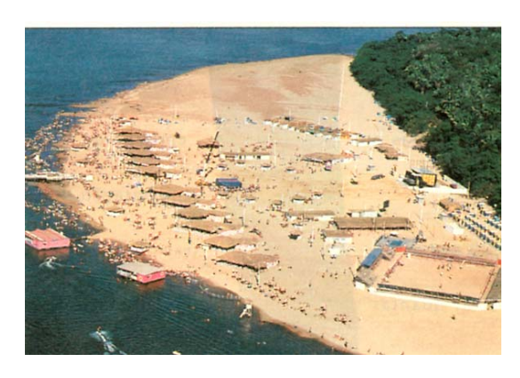
Figs. 5 & 6. The plan for Palmas new capital city of Tocantins State followed classic modernism (left), but the reservoir provides important public amenities (right).

The experience of Palmas demonstrates the gap between intentions and acts, and represents a lost opportunity to create a truly contemporary city, ecological and sustainable, as the city's original conception document hoped for. Its are similar to those afflicting any other large city in Brazil: incomplete urban services and infrastructure, inefficient public transportation, disrespect of the zoning principles, great tracts of land left empty on fully serviced areas, and a growing contingent of squatter settlements. However, in establishing a new administrative pole and attracting large numbers of governmental employees, entrepreneurs, developers, retail, services and thousands of families in search of opportunities, and in implementing new regional accessibilities, Palmas is undeniably a successful development effort with clear reflections over the whole region and the state.