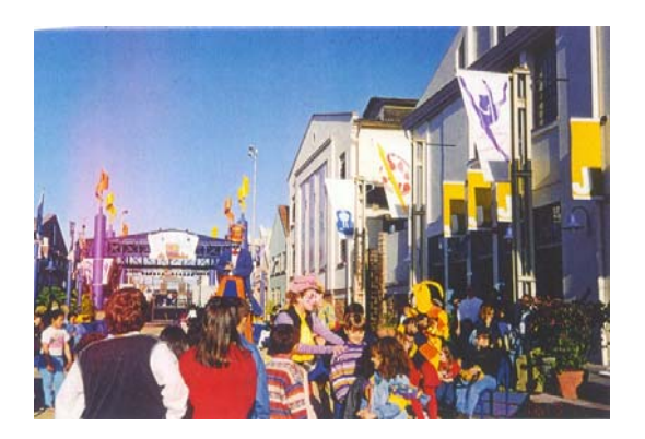
Figs. 9 & 10. A renovated block with a central plaza and underground parking in Pelourinho, Salvador, and the DC Navegantes outlet shopping district in Porto Alegre.