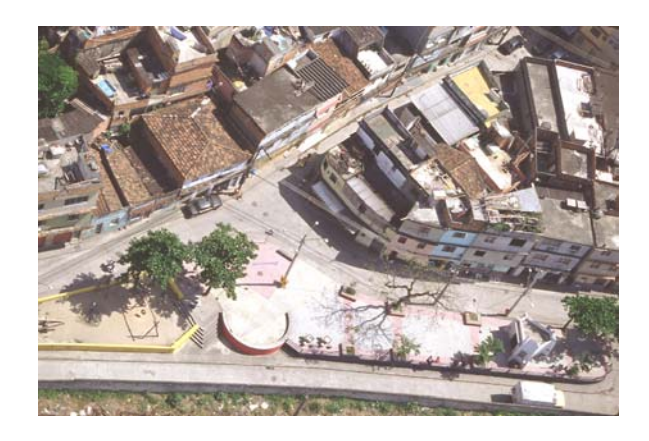
Figs. 13 & 14. In São Paulo, left over spaces are utilized to create new connections, and in Rio the Favela Bairro project upgraded almost 100 squatter settlements. Images courtesy of C. Leite and Fabrica Arquitetura..

Lastly, I want to comment on the Favela Bairro, an innovated program launched by the city of Rio de Janeiro in 1994 to upgrade favelas .<sup>19</sup> Because the city understood that favelas are perceived as places of marginality but differently from previous policies Favela-Bairro recognized the long-term social and capital investments that squatters did to their environment by providing them with physical upgrading, access to public services, basic social programs, and most importantly land titles. Environmental upgrading and security of tenure are fundamental steps toward community development, integration to the city, socialization, and eventually full