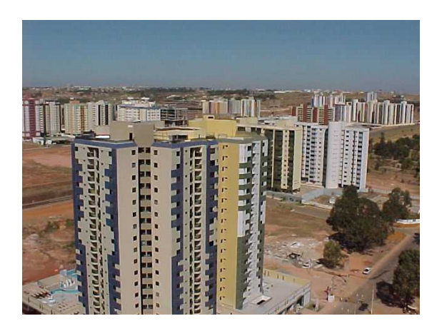
Figs. 3 & 4: Late modernism in Brasilia: Taguatinga satellite town (left) and the new suburban district of Aguas Clara (right).

These types mix in space and have suffered transformations in their tectonic expressions, such as the more recent residential and commercial sectors in the Pilot Plan which reflect postmodernist architectural imagery, the favelas which now look more like vernacular spaces, the old workers' camps which have lost their original distinctiveness, and the new residential neighborhoods which partially redeem classic modernism but incorporate contemporary attributes such as gates and walls. Although all these morphologies contribute to a busy contemporary metropolis not all are recognized as part of the formal image of Brasilia and are not part of the middle-class repertoire of desirable places. The Pilot Plan's classical modernism continues to represent the utopian image of urban desirability with none of the conflicts of large cities such as Rio and São Paulo.