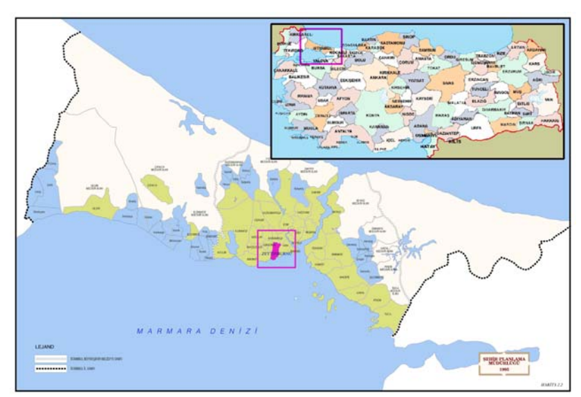
Figure 1. Location of Zeytinburnu District within national and provincial scale

The Zeytinburnu District is located at the western side of the province of Istanbul, covering a total of 1142 hectares (Figure 1). Zeytinburnu is located between Bakırkoy, Fatih and Bayrampasa. The district is directly connected to the E-5 highway and the Bosphorus Bridge. It is also possible to access TEM (Trans European Motorway) and thus also to Fatih Sultan Mehmet Bridge. Therefore it is an important window of Istanbul opening to the outer world. It is surrounded by Fatih to the east, Bayrampaşa to the north, Gungoren and Bakırkoy to the west and Marmara Sea to the south. The district was governed by the Fatih Municipality in the east and the Bakırkoy Municipality in the west until 1953, but became a municipality in 1953, and in 1957 became the 14<sup>th</sup> district of Istanbul. Considering the population density in the districts at Istanbul in year 2000, in Zeytinburnu the density is 20,639 persons per square kilometers. The district is the 8<sup>th</sup> most densely district in Istanbul due to this reason.