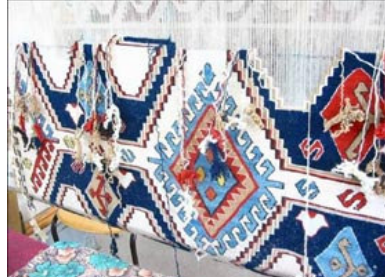
Photo 5. Beypazarı Public Education Centre Carpet Workshop, 2005

For the local foods, the local government permitted citizens to sell their local products on the stands and in historical buildings. In general these stands are managed by women (Photo 6). Additionally, there are some special restaurants which introduce the local identity and culture by serving local foods to the visitors.