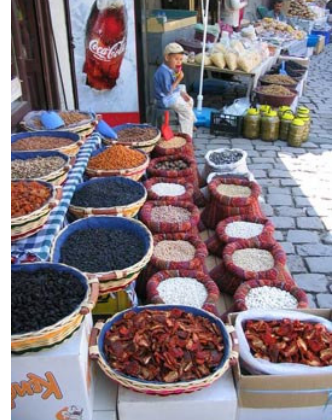
Photo 6. Stands for selling traditional products

3<sup>rd</sup> type of the project is "protecting the Turkish language with local words / tongue". As it known language is a key component of the cultures. For reaching this aim the municipal council took a decision which prohibited the using of foreign words on the labels of work places. This decision was appreciated by many organizations and primarily Turkish language organization and received many awards both from the state and non-governmental organizations. Within this context, 5600 local words were identified with a competition and forwarded to Turkish Language Association (Beypazarı Belediyesi, 2005).