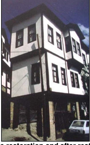
Photo 4. The restored houses (before restoration and after restoration) (Beypazarı Municipality)

In conclusion, with the implementation of these restoration projects Municipality took a big step in sustaining historical and architectural pattern of the settlement, maintaining the traditional lifestyles, rising of the economic values of the houses, increasing the awareness of the importance of conserving historic buildings and returning from apartment buildings to detached houses. All these implementations are realized by participatory planning approach.