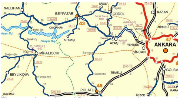
Figure 1. Location of Beypazarı

Beypazarı is located northwest of Ankara in Central Anatolia Region and surrounded by Ayaş, Güdül, Nallıhan and Polatlı districts (Figure 1). According to the Turkish Statistical Institute, Beypazarı is the biggest district of Ankara with population of 51.841 in 2000 (TURKSTAT, 2000). 66 percent of its population situated in city center and the rest of them are living in villages. Beypazarı was one of the prominent center of settlements during the Hittite, Phyrigian, Galatian, Byzantian and Seljuki periods and lastly during the Ottoman Empire period. Being located on historical Silk Road, which was towards from İstanbul to Bağdat during the Romans up to Republic period, increased the importance of the city as a commercial center. Along with official records, the population of Beypazarı in 1573 was 10.000 people, and this also shows the historical importance of the city (www.beypazari-bld.gov.tr).