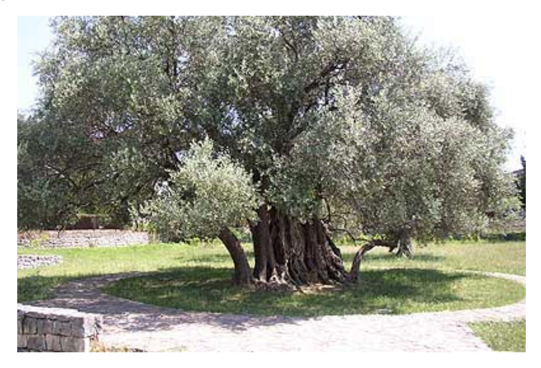
Figure 3: The oldest olive tree in Old Bar

The town is a Montenegrin multicultural phenomenon and it is the most important medieval archaeological site in the Balkan region.