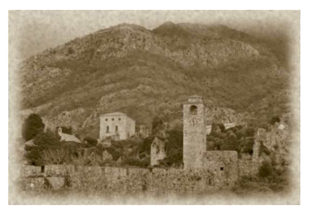
Figure 2: Old Bar

Old Bar is built inland and shows fascinating urban solutions which have stood the test of time for centuries. For a few hundred years it has been invisible, hidden among dense olive groves. Within, there is a ruinous village surrounded by a wall, and the wreck of an old Venetian fortress surrounded by mosques and bazaars (fig. 2).