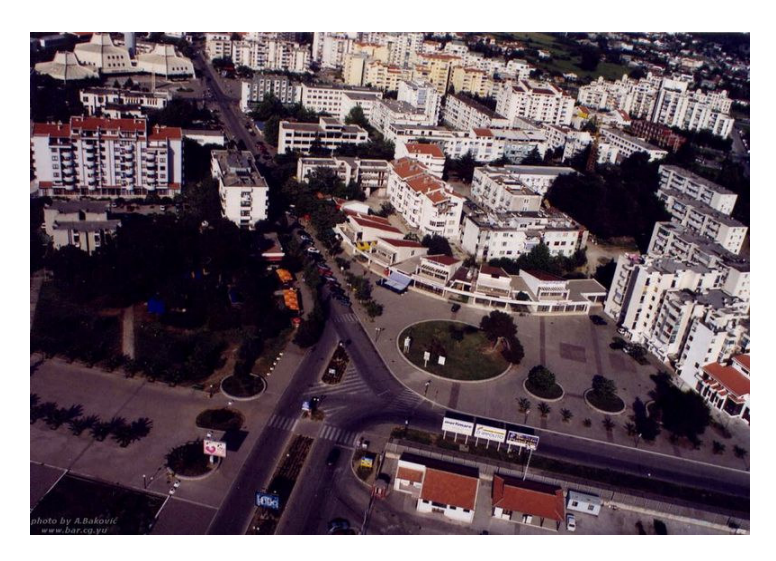
Figure 5: Bar - Topolica

First Master Plan (GUP) of Bar was carried out in 1970 and it represented the first significant urban document .The plan itself was based on the modern planning of the town with the aim to move it on towards the north-west and to define main traffic roads parallel to the sea coast line. After the earthquake on the Montenegrin coast in 1979, the new trend of the Bars urban development became visible and they indicators of a revised of Master Plan of Bar in 1985 year. This plan is still current, but significant point of this plan is interesting up to today, that the center of the town is not defined as well as the complete development plan of the region (fig.5).