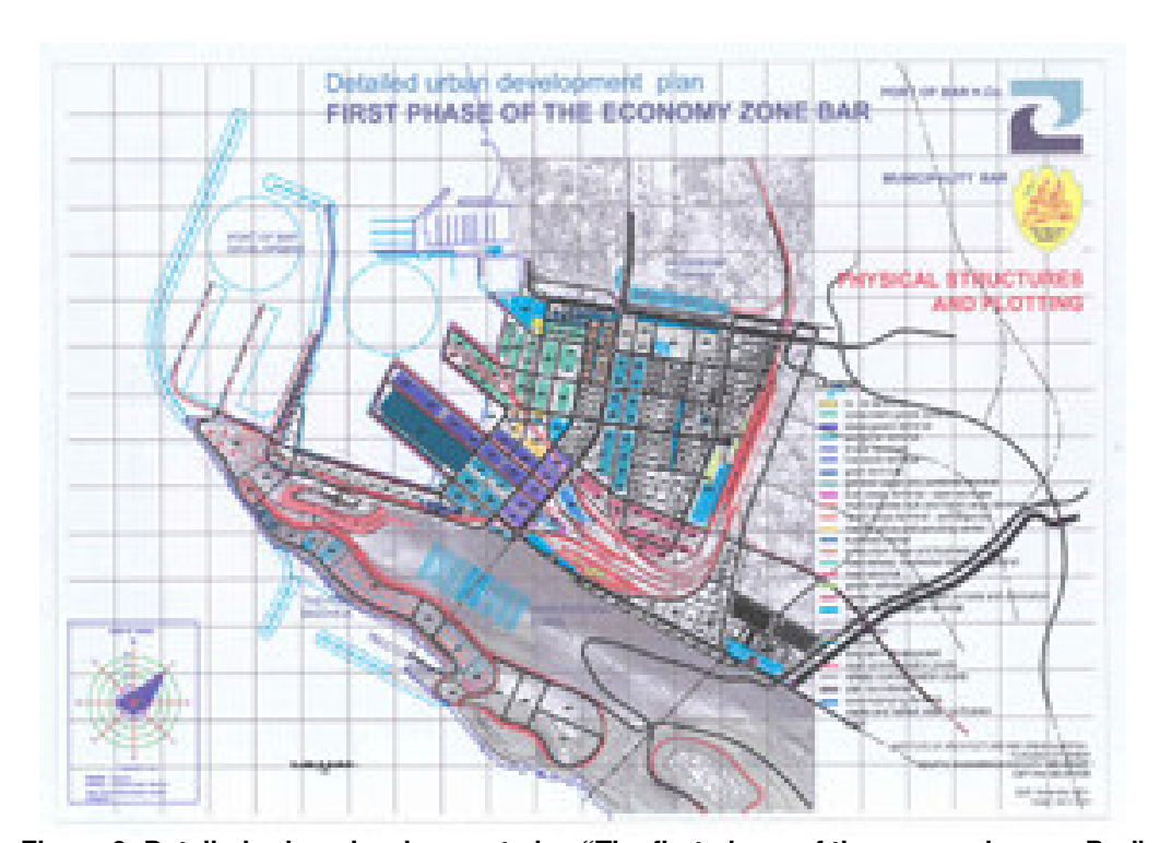
Figure 6: Detailed urban development plan "The first phase of the economic zone Bar"

The port of Bar is a modern sea port with high-quality handling services for all types of cargo. The forming of a free customs zone enables better organization of production, as well as some particular advantages made possible by the provisions regulating the rights and obligations within the Free zone (fig.6).