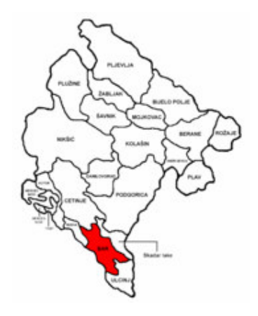
Figure 1: Position of Bars Municipality in Montenegro http://de.wikipedia.org/wiki/Bar_(Montenegro

Bar is a coastal town, situated in the south-eastern part of Montenegro on the Adriatic Sea (fig 1).