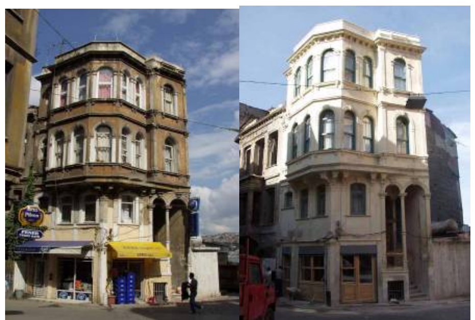
PHOTO 4-5. TEVKII CAFER QUARTER, VODINA STREET, NO: 2 (BEFORE AND AFTER RESTORATION)

As a good case, Ankara - Hacibayram Mosque Environment Arrangement experience has importance for this subject. In that project is a "Consultation and Orientation Committee" was established with participation of Municipality and local people which carried out implementations.