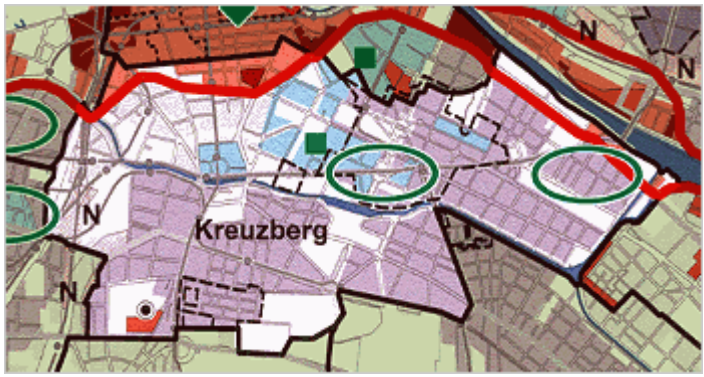
MAP 1. KREUZBERG AREA IN BERLIN

City renewal in the 1960's and 70's meant large-area demolition and new construction on the open land. Standing structures were usually destroyed. At the end of the 70's, this practice was discontinued in favour of preserving the street block structure in the existing city area. Then buildings were individually modernized or empty land was built on. The densely built-up areas were only partly torn down and interspersed with open spaces. Nevertheless, the destruction of standing structures continued. The house squatter movement in the early 80's contributed to the growing consciousness of the problem and the international building exhibition (IBA) marked the official turning away from former city renewal concepts. Twelve ground rules for a "careful urban renewal" were passed.