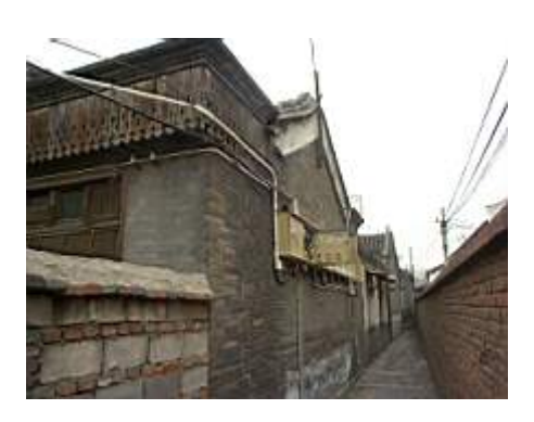
Beijing hutong's protect

complicated degree of Beijing hutong are all well-known in the whole worlds. Therefore hutong break through the decision of the city transportation" tiny circulation" and should go carefully, because of, hutong is not the valid road transportation resources.