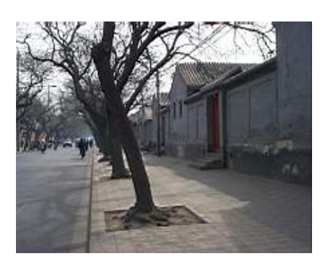
The hutong's color(From <a href="https://www.news.cn">WWW.news.cn</a>)

and walk a pair of rows car of hutong, establish to lead to go the marking, lead the mobile car into hutong, have already make sure to plan 30.But, this decision actually can can be carried out?Can let hutong become" bridge" that breaks through" tiny circulation" of the city transportation?To the integration that hutong protects whether beneficial?