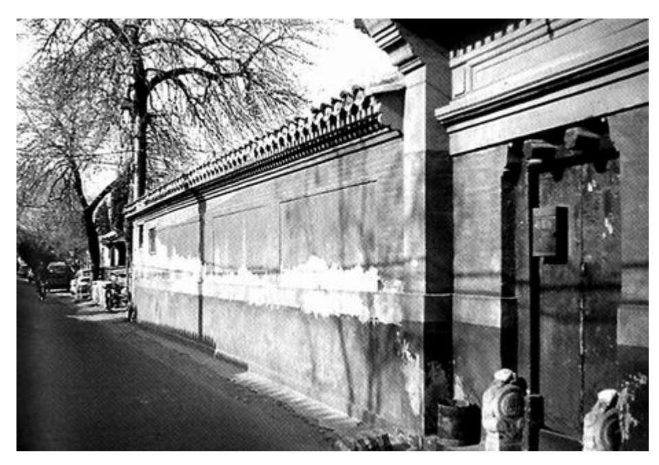
Green 's problem

Beijing hutong is green to turn the system not integrity. Existing have some ancient trees, but, protect not good. Because hutong the width is not enough, be in need of green turn with the ground.