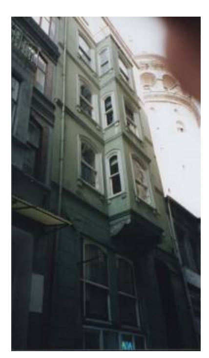
Figure 6: Some gentrified housing in Galata

Building T is a five storey apartment building in Tatar Bey Street with 9 units. The range of the rent levels change between 150 and 300 YTL (130$-200$). The building is recently bought by Galata AŞ, a Turkish and English partnership real estate company which has bought several buildings in the area in the last few years. The residents living in building T resemble those in building B, in that they are composed of low-income tenants. They did not, however, show the same level of resistance that those in building B did. They have easily agreed to leave their dwellings when the landlord offered them a year-long stay free of rent. There may be a variety of factors that may help them to give that decision but here, we will focus on one single factor: the level of awareness about their legal rights. One of the renter residents describes the day when the new landlord came with their lawyers in order to make a contract: