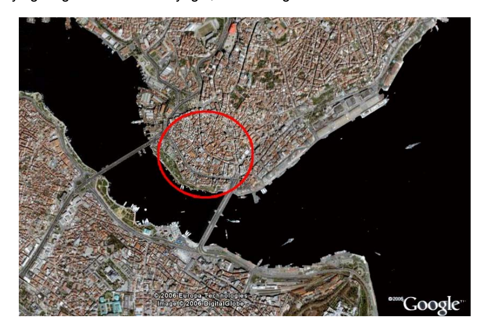
Figure 1: Location of Galata within the District of Beyoglu on the northern banks of the Golden Horn

Gentrification in Galata is part of a general gentrification process that has been taking place in Beyoglu since the early 1990s. The process in Galata has proceeded at a slower pace than other gentrifying neighborhoods in Beyoglu, like Cihangir and Asmalı Mescit.