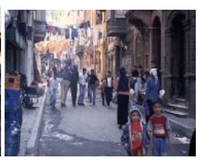
Figure 4: Village atmosphere and social relations in and around Galata

It is important to stress here that the picture drawn by the latter interviewee is a yawning nostalgia and a description of the recent past, rather than of today. Today, the neighborhood has already lost an important portion of its population and thus do not possess the same level of social relations it used to have. Apparently, by the departure of each local resident, the neighborhood loses something from this "village" atmosphere and there remain lesser reasons for the remaining to stay.