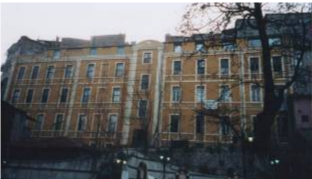
Figure 5: Before and after gentrification-led restorations