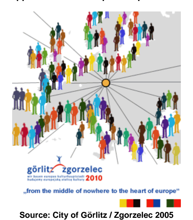
Graphic 3: application for "European Capital of Culture 2010"

The renewal of the heritage in the inner city since 1990 and the foundation of the campus-college Zittau/Görlitz in 1992 have been the most important strategic projects in the 1990<sup>th</sup>. Since the beginning of the new century, urban planners in Görlitz have put their main emphasis on one strategic project: the application for the title "European Capital of Culture 2010". In 2001, politics of Görlitz and Zgorzelec have reached the decision for the application. In 2003 a local association was founded to support the application. In 2006 Görlitz and Essen (Ruhr area) have been elected as German candidates for "European Capital of Culture 2010". The application of Görlitz has carried under the title "From the middle of nowhere to the heart of Europe" (Stadt Görlitz 2005).