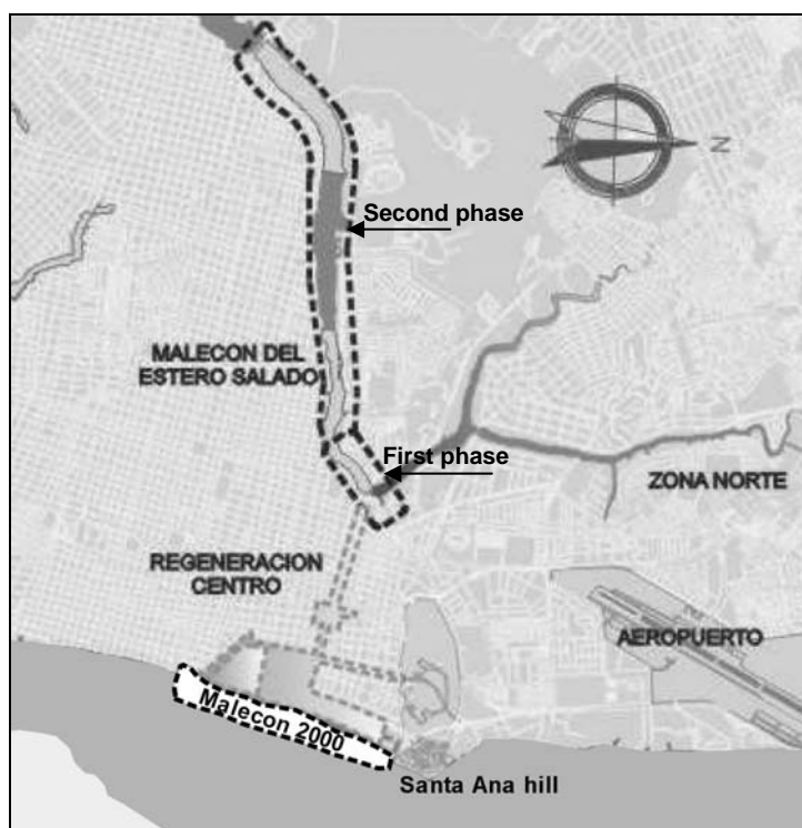
Figure 4 Location of the main project of Guayaquil's urban regeneration

The whole project consists of the regeneration of the 4 km-long fronts of the Estero Salado. The first stage extends itself over one kilometer long over an area of 5.6 hectares, with an investment of almost 20 million US dollars. The works were initiated in January 2002 and the first part was inaugurated in October 2003. Most users of the first part are students of the universities located in the area: the State university (50,000 students) and the Catholic University (12,000 students). 11 Figure 4 shows the location of the different phases of the regeneration in Guayaquil in dotted lines, illustrating the Malecón del Estero Salado's project total area and first phase.