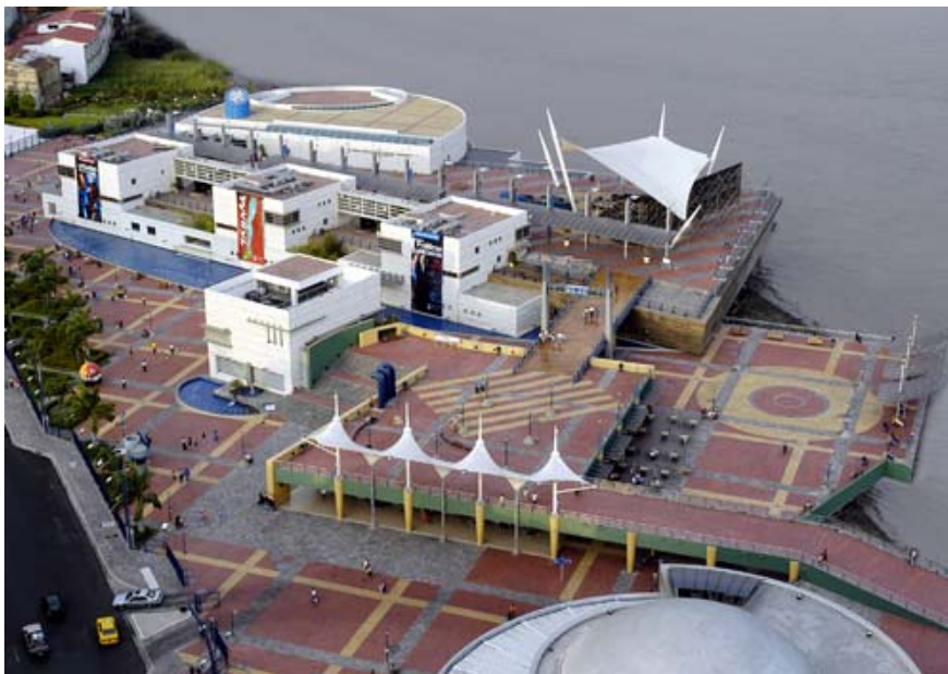
Figure 3 Museum of Anthropology and Contemporary Art (MAAC)

The north side of the malecón, heading to the Santa Ana hill, is dedicated to recreational and cultural uses. The great attraction here is the Museum of Anthropology and Contemporary Art (MAAC), an important landmark in the city. It includes an auditory, theater, gardens with didactic orientation, a maritime museum, and kiosks and cafeterias (see Figure 3).