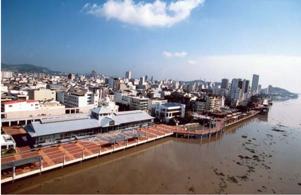
Figure 2 The South Market and surroundings

Centre constituted by four galleries of 238 commercial spaces and 8 cafés, with 17 restaurants with a view to the river in the upper level. This is complemented by a place to hire boats, children playgrounds, a handicrafts market and spaces for selling flowers.