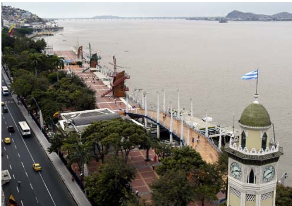
Figure 1 Malecón 2000, with the Moorish tower at the right

To tackle the deficit of green areas in the centre, it was planned to create an area for gardens, whose objective was the conservation of local species, the culture of native species and foreign species, and the preservation of some trees in danger of extinction. The project also included the restoration of the historic landmarks, a museum and a commercial centre, articulated through a series of paths, terraces and children playgrounds. In order to not disturb the view of the existing buildings along the riverside, the new buildings would not exceed the height of the existing trees of the riverside while their roofs could be used as part of the promenade routes. To diminish the lack of parking places in the centre, 3500 of them were projected in underground spaces.